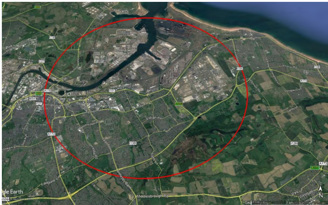
Figure 1: 5km Cycle Catchment